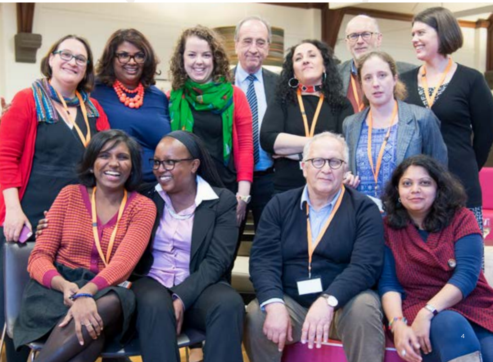
DLN Representatives and Organising Committee

DLN is grateful for the generous support of the conference sponsors: the Department of Foreign Affairs and Trade (DFAT), the Victorian Multicultural Commission, the University of Melbourne, the Research for Development Impact Network, Oxfam Australia, the Australian Red Cross and Diaspora Action Australia.