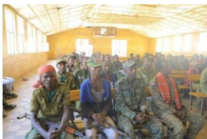
Militia training, January, Galamso, West Hararge

Large numbers of recently graduated anti-riot and police trainees (above, in Amhara region) are taking over some security functions of the ENDF. 5 But the greatest damage is being done by poorly trained and even more poorly disciplined militia, including the infamous, better-armed and more dangerous gaachana sirnaa .