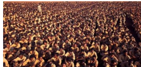
10,000 trainees, Amhara Region. Addis Standard , 4 April

Impoverished farmers are being forced to surrender over half of their wheat yield to the government at 50% of the market price. Taxes are arbitrarily imposed for a variety of reasons – construction of kebele offices, meals for university students, uniforms and ammunition for militia or ENDF, road widening projects and, recently more often, ‘health insurance.’